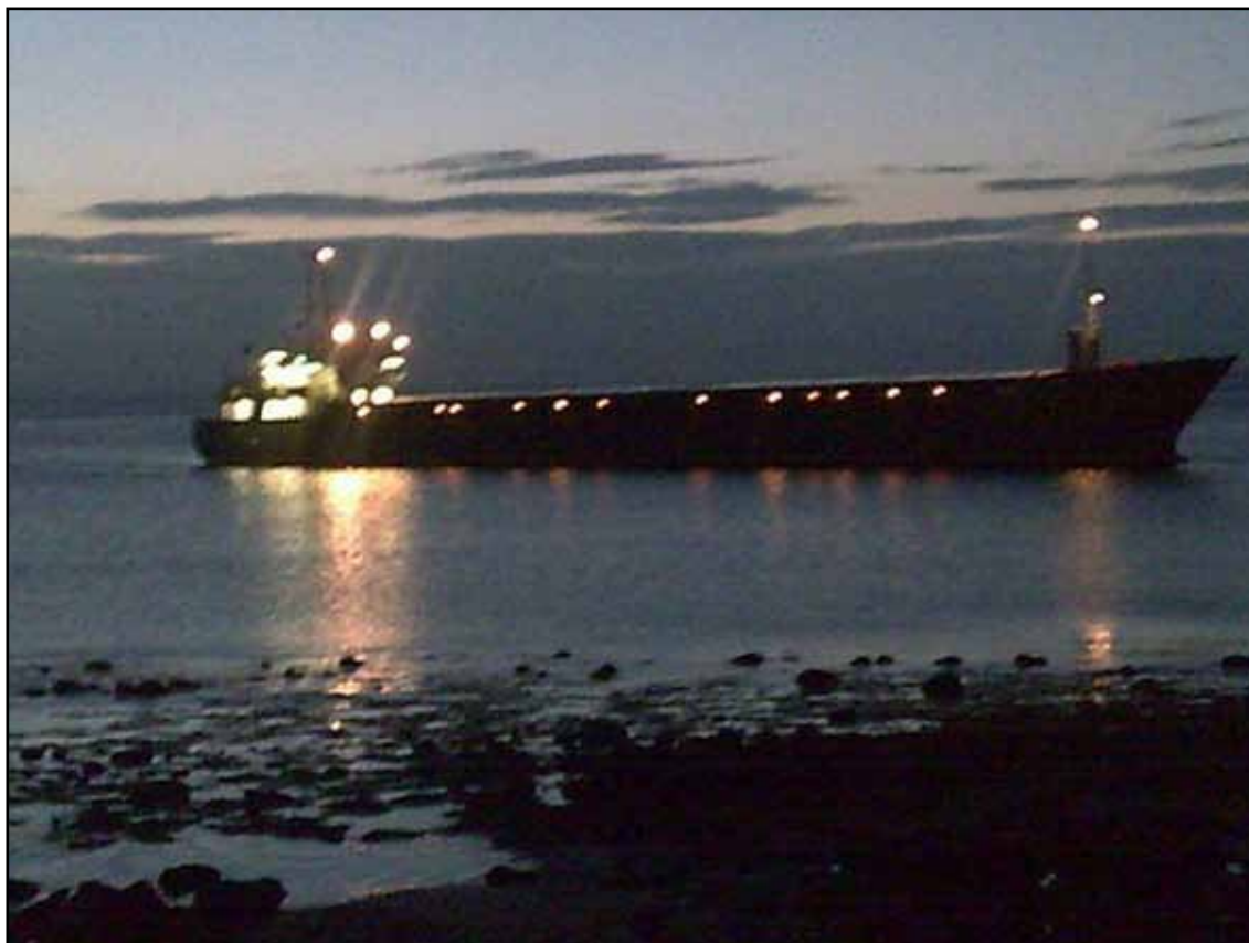
Antari aground on the Antrim coast

At 0420 the coastguard contacted the Larne lifeboat, requested it to launch and proceed to the scene, and also instructed a coastguard rescue team to proceed to the area.