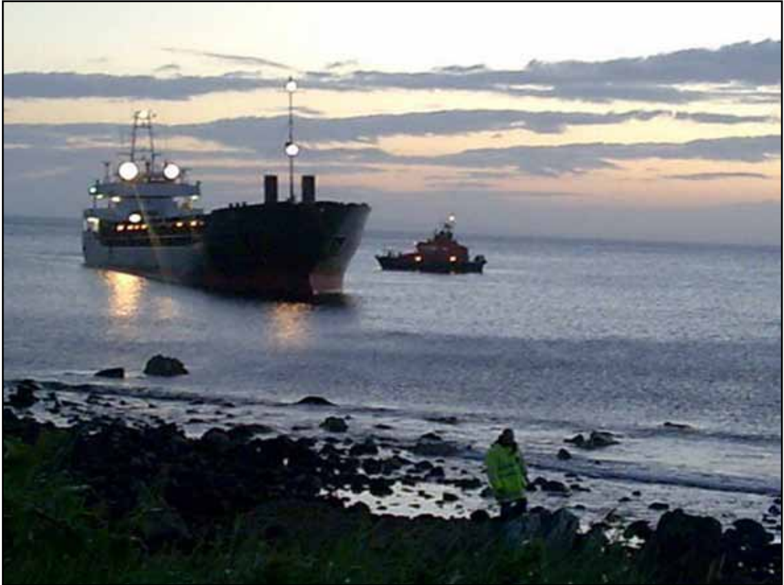
Larne lifeboat checks Antari 's hull for damage

Once Antari was afloat, the master informed the coastguard and arranged for further soundings of the tanks and spaces to be carried out to confirm the vessel's watertight integrity.