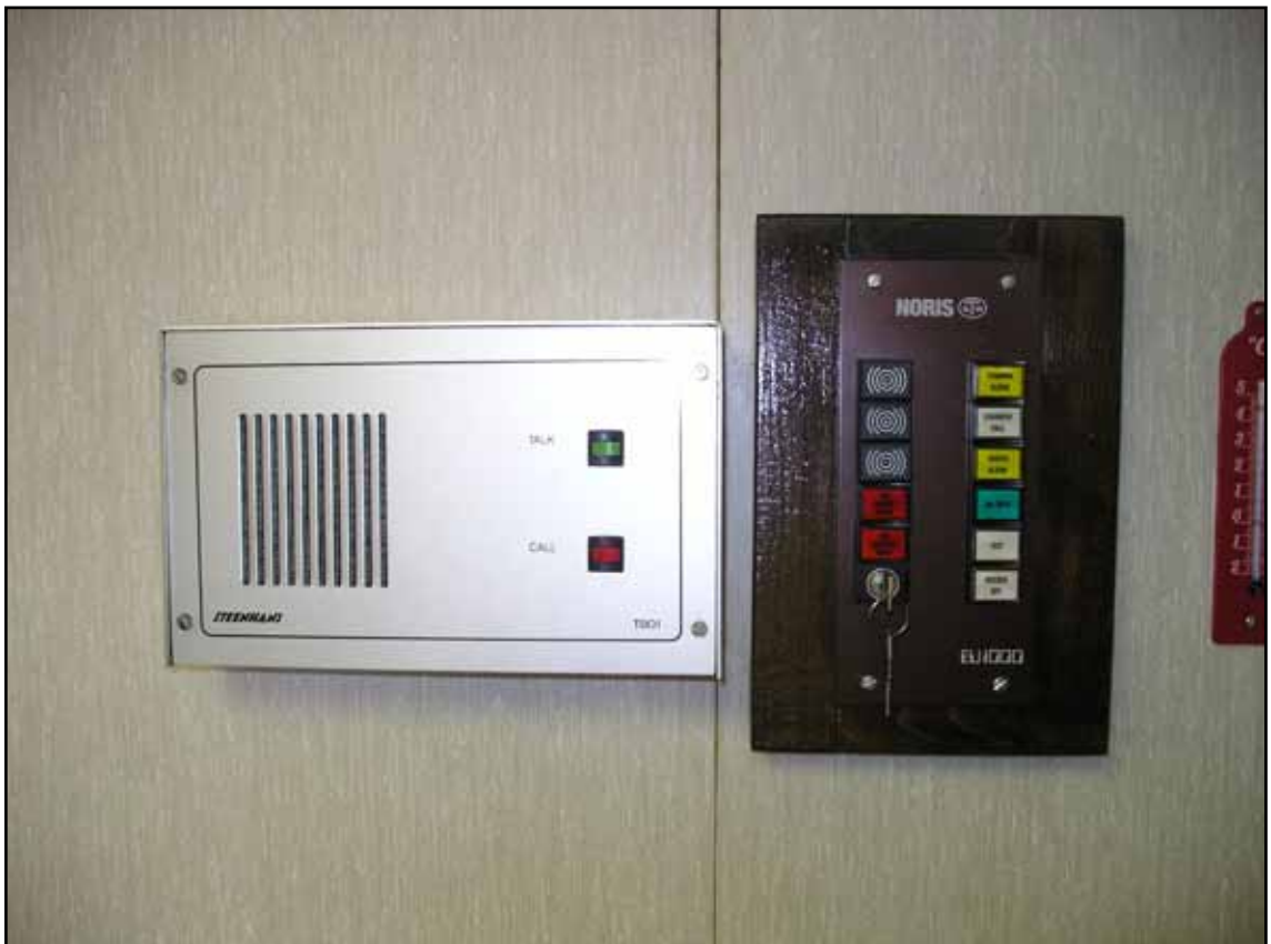
Watch alarm repeater in master's cabin