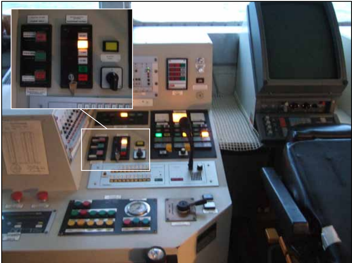
Watch alarm in wheelhouse