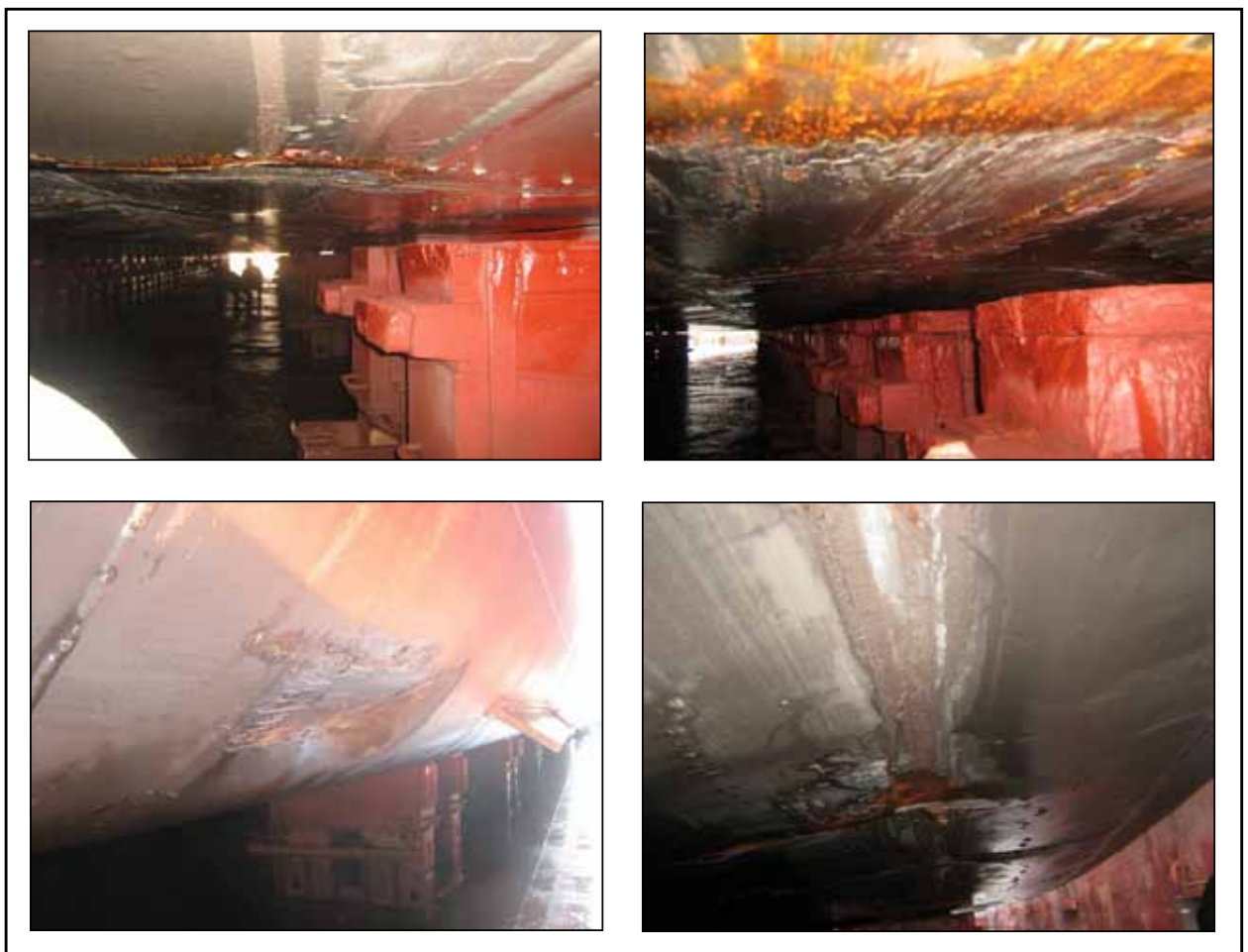
Damage to bottom