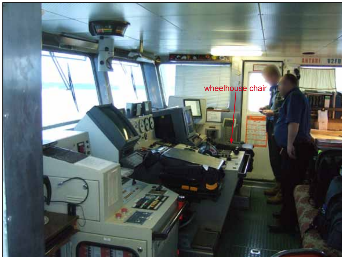
Antari , wheelhouse chair in which chief officer fell asleep

The master was woken by the sound of the vessel taking the ground, and he went straight to the bridge. He found the chief officer awake, trying to assess what had happened.