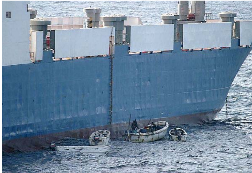
Figure 3. Using small vessels, Somali pirates armed with rocket-propelled grenades and AK-47 assault rifles hijack the MV Faina in September 2008.

T-72 tanks and other weapons and ammunition. The captain of the vessel died during the assault, and the pirates demanded $35 million for the release of the ship and the crew. (See figure 3.)