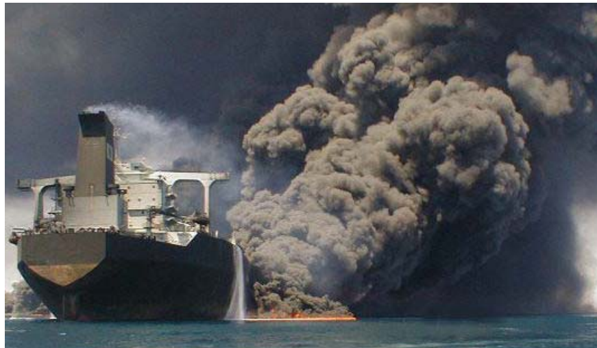
Figure 2. M/V Limburg on fire off the coast of Yemen after being struck by an Al-Qaeda waterborne improvised explosive device.

In October 2002, Al-Qaeda directed an attack by an explosive-laden small boat against the French oil tanker M/V Limburg off the coast of Yemen. The attack resulted in a large oil spill and fires on board the tanker, and killed one and injured four crew members. (See figure 2.)