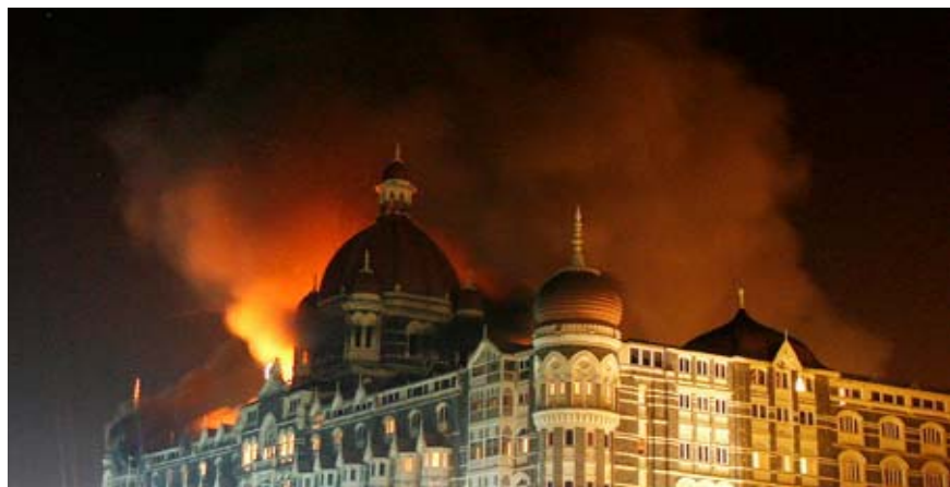
Figure 4. Eleven terrorists went ashore in inflatable boats and attacked the Taj Mahal Hotel in Mumbai, India.

In November 2008, terrorists hijacked a Pakistani fishing boat, killing the captain and crew. The terrorists then sailed the boat to Mumbai, India, where they went ashore in small inflatable boats and carried out an attack that killed more than 170 people and held India’s financial capital hostage for 3 days. (See figure 4.)