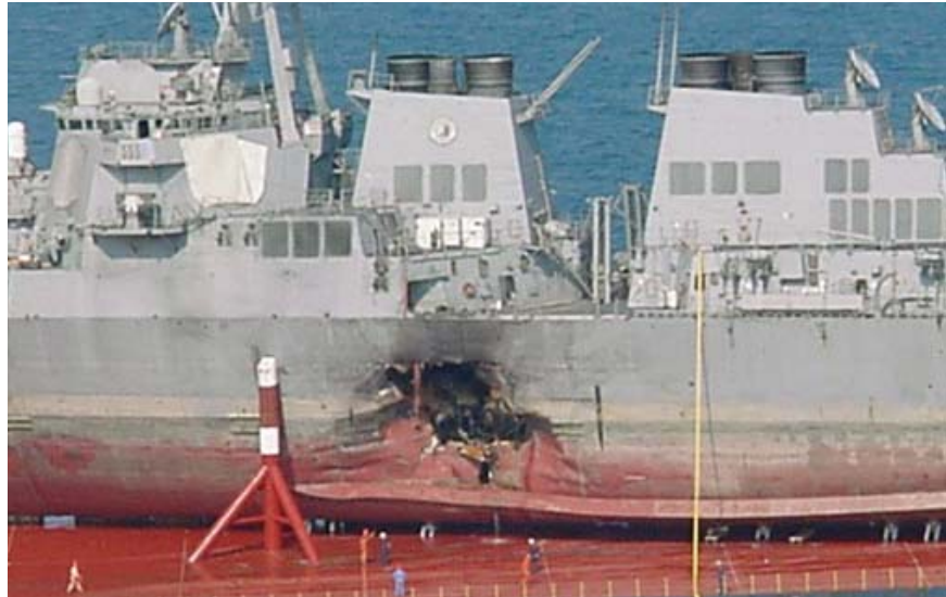
Figure 1. The USS Cole with a large hole in her left side after being struck by an Al-Qaeda waterborne improvised explosive device.

In October 2002, Al-Qaeda directed an attack by an explosive-laden small boat against the French oil tanker M/V Limburg off the coast of Yemen. The attack resulted in a large oil spill and fires on board the tanker, and killed one and injured four crew members. (See figure 2.)